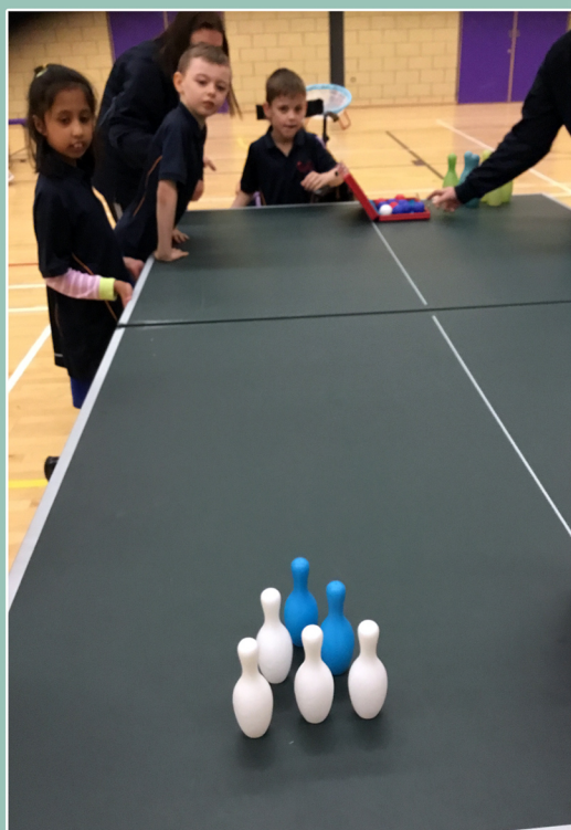
Table Top Games Event

Some of our students have explored their sporty side this term by attending a table top games event at Durham Universities Stockton Campus.